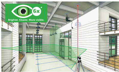
* Approx. 6 times brighter than a typical red laser with 630 - 660 nm