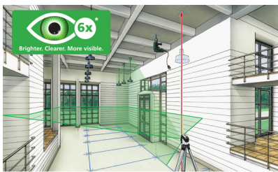
* Approx. 6 times brighter than a typical red laser with 630 - 660 nm